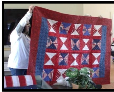
A beautiful handmade quilt was presented by the Quilts of Valor